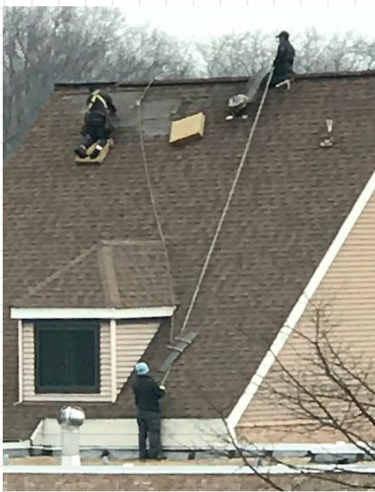
Workers repair storm damaged roof at Sierra Landing