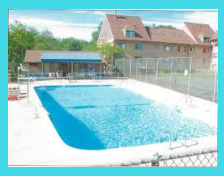
OPEN MAY 26 THRU SEPT 1 THURSDAY AND FRIDAY 4:00PM - 8:30PM SAT. SUN. AND HOLIDAYS 12 NOON - 8:30 PM

All residents should be aware that the pool management company has been given strict instructions to check the pool pass registration list for every resident and to require that every resident sign-in when entering the pool facility. This is being done in order to ensure that the pool is only being used by members and their guest.