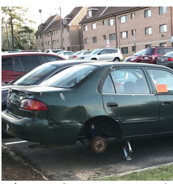
Did we mention no garage work on cars in the lot? No wheels, no liscense plate, no permit! WOW!