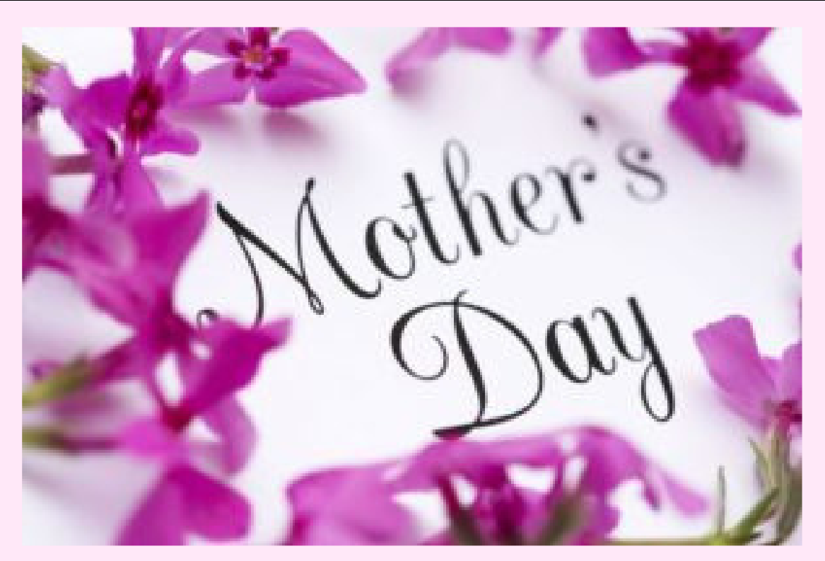
ON SUNDAY MAY 13TH SIERRA LANDING WISHES EVERY MOTHER AND GRANDMOTHER A WONDERFUL MOTHER'S DAY!