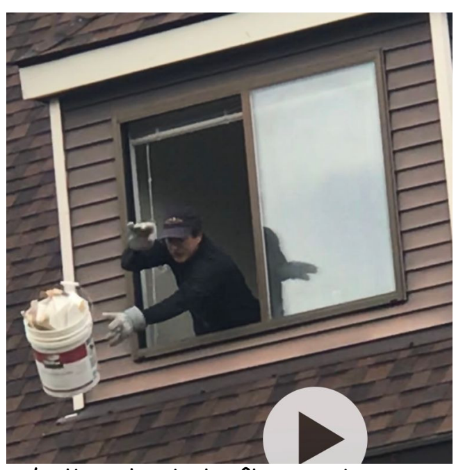
What's a bucket after you've thrown out the sink?